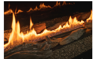
optional ceramic logs or white stones (installed on top of the burner)